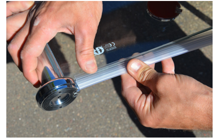
Slide seal onto glass if desired.