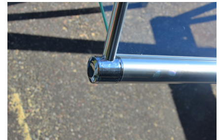
Add decorative cap onto tie bar receptor.