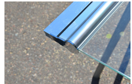
Decorative cap installed.